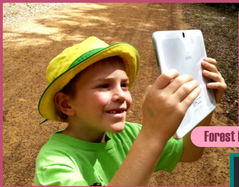
Forest Foto Fun