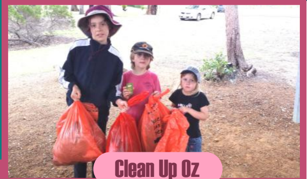
Clean Up Oz